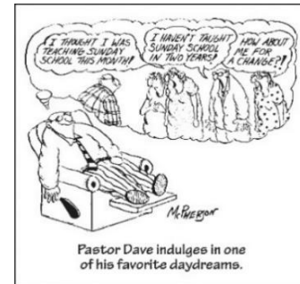
Pastor Dave indulges in one of his favorite daydreams.

Kadesh News: We are just one week away from our first session of summer camp. Our first week is Kids Week for ages 8 – 10. A big thank you to everyone praying for our spring school season. This past week we hosted 11 schools and over 300 students to finish our last week at full capacity. We pray that God will use the interactions that we had with teachers and students to make a difference in their lives.