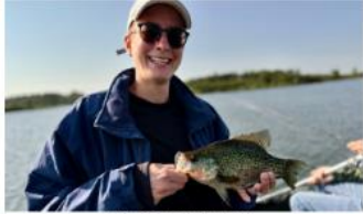
FISHING WITH FAMILY

“Thank you for praying for my sabbatical. Now that it’s October, I’m easing back into my normal schedule. I praise God for a restful sabbatical & that my team did well while I was away. Please pray for adjusting back to ‘work mode’ and for upcoming travels and work projects.”